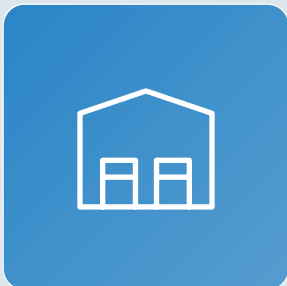
11 level access loading doors