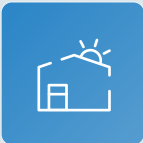
Solar PV Array producing 438 kWp