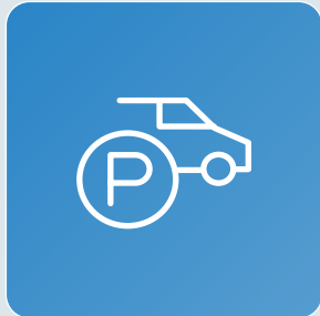
Allocated car parking