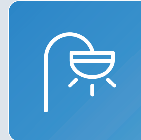
Overall site benefits from estate lighting