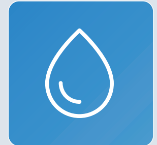
Water & power