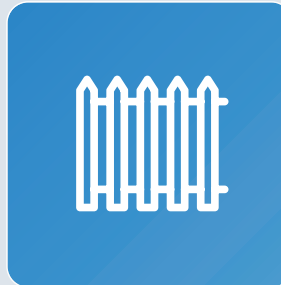
Fully fenced & secure plots

The wider estate provides a secure gated entrance with the benefit of on site security. Link Park operates restricted hours of usage for the site between 6 am - 6 pm on Weekdays and 7am – 2pm on Weekends.