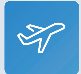
Close proximity to Heathrow Airport