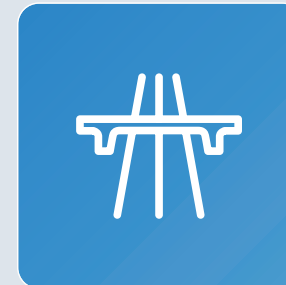
Access to M25, M4 & M40