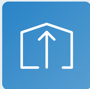
5.5m to 7.8m clear internal height

Unit 2 comprises of a mid-terrace industrial/warehouse unit with two storey offices, allocated parking spaces and generous rear yard/loading area suitable for articulated lorry deliveries. The two storey offices benefit a separate pedestrian access which fronts Western Road. The unit is to be refurbished.