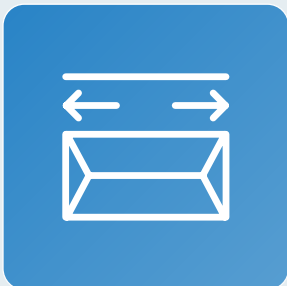
Generous rear loading area and yard