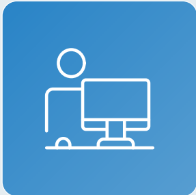
Offices with separate access