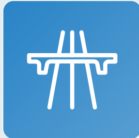
2 miles to A329(M), access to M4