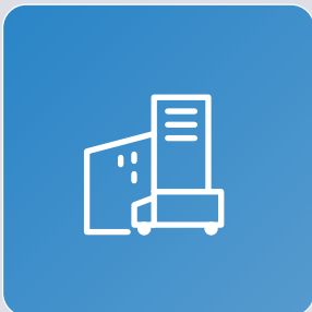
Self contained site