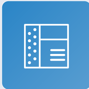
180,529 sq ft (4.14 acres) available