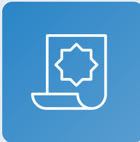
Class 2 IOS site

Ridham Dock is a substantial South East site, which has a strong focus on industrial, recycling and waste management. Developed as a dock in 1913 to serve the paper mill at Kemsley 1.5 miles to the south.