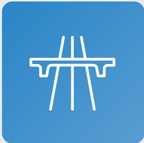
Excellent connections 10 min from M2