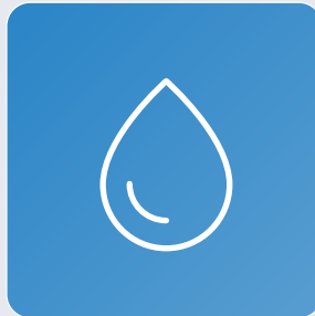
Power and water on site